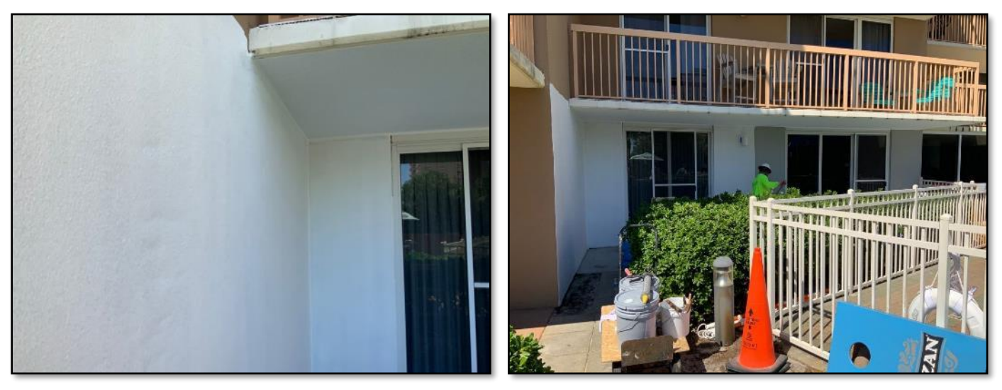
FIGURE 1 - Overall view of primer application at ground floor mockup.