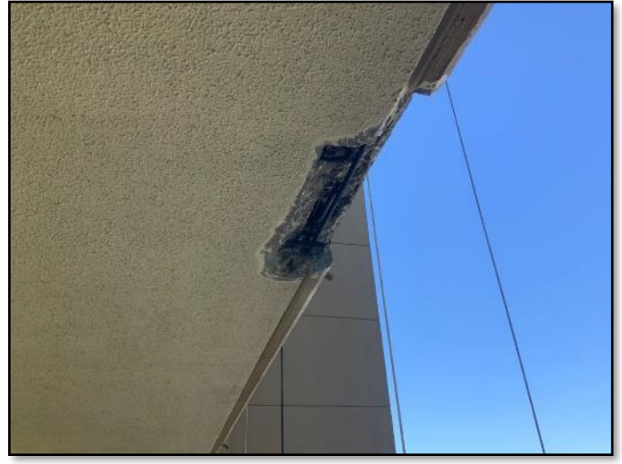
FIGURE 5 - Overall view of concrete removed around corroded rebar treated with corrosion inhibitor.