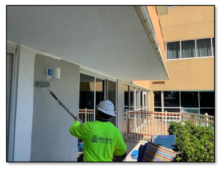
FIGURE 3 - Overall view of mockup location.

2.4 BE-CI also observed a swing stage had been erected for work on Drop 33 on the North Elevation. BE-CI observed concrete repair preparation had begun on the outside face of the knee walls along the common walkway. BE-CI observed that finish texture had been removed at cracks and small spalls, and that concrete had been removed around corroded rebar (Reference Figure 4). BE-CI observed rebar had been treated with MasterEmaco P124 corrosion inhibitor (Reference Figure 5). BE-CI observed preparation for concrete repairs at Drop 33 to be a work in progress at the time of the site visit.