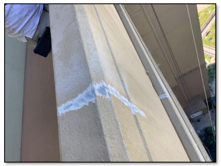
FIGURE 4 - Close-up view of finish material removed around concrete crack prior to routing and sealing.

2.4 BE-CI also observed a swing stage had been erected for work on Drop 33 on the North Elevation. BE-CI observed concrete repair preparation had begun on the outside face of the knee walls along the common walkway. BE-CI observed that finish texture had been removed at cracks and small spalls, and that concrete had been removed around corroded rebar (Reference Figure 4). BE-CI observed rebar had been treated with MasterEmaco P124 corrosion inhibitor (Reference Figure 5). BE-CI observed preparation for concrete repairs at Drop 33 to be a work in progress at the time of the site visit.